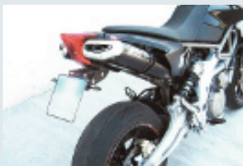
...Zard's Streetfighter system