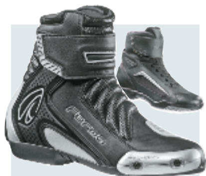
Diablo offers comfort and protection for town riding