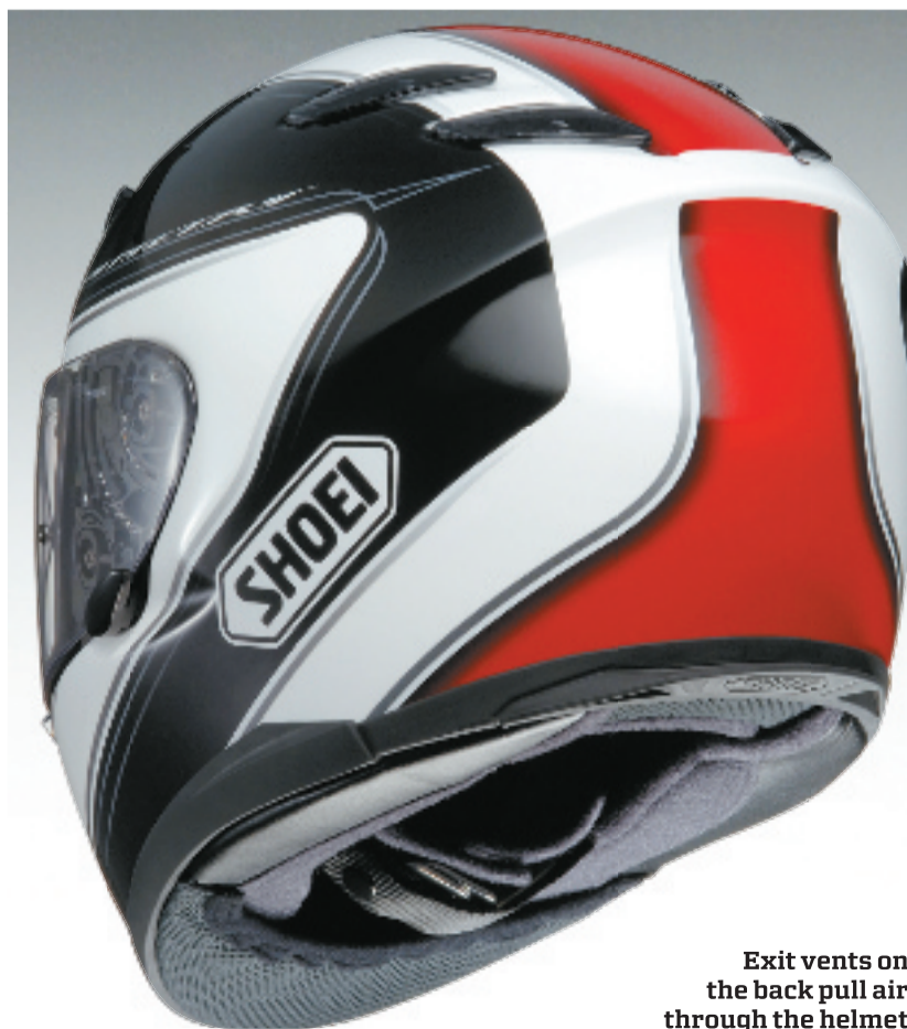
Exit vents on the back pull air through the helmet